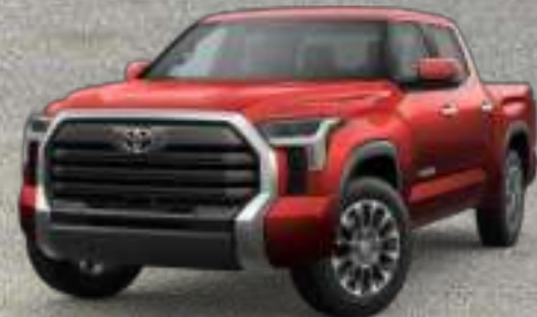
2023 TOYOTA THUNDRA CREWMAX SR5 V6 3.5L PETROL 4WD AT